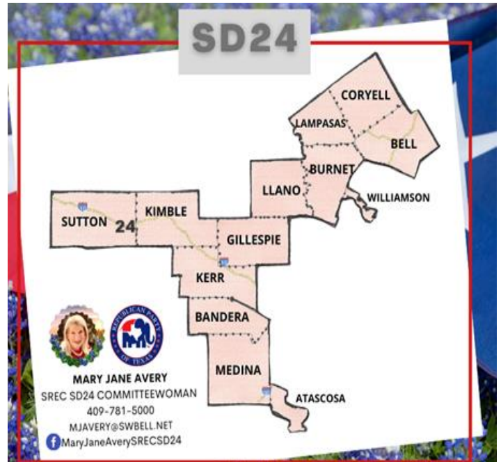
Redistricting Map for SD 24